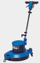
Nilco Vario Ultra 550