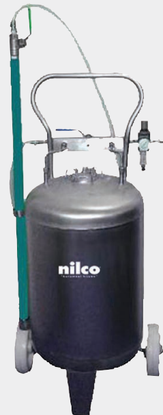
LOW PRESSURE MOBILE FOAM GENERATOR