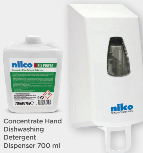
Concentrate Hand Dishwashing Detergent Dispenser 700 ml

The professional kitchen hygiene products and dosing equipment in Nilco's portfolio ensures that excellent tastes are prepared in a perfect hygienic environment of the industrial kitchens and offered to the customers of restaurant, hotel, café, hospital and catering companies healthy.