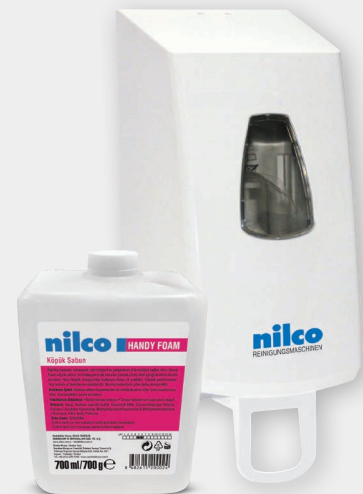
Cartridge Foam Soap Dispenser 700 ml