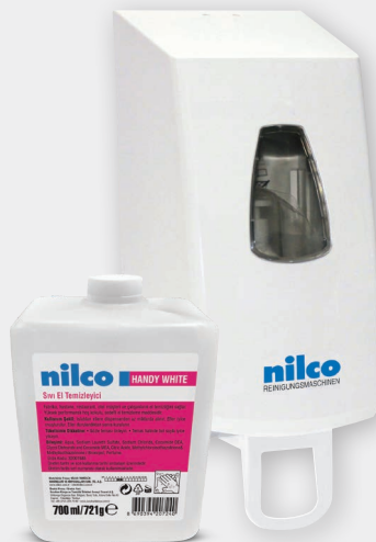
Cartridge Liquid Soap Dispenser 700 ml