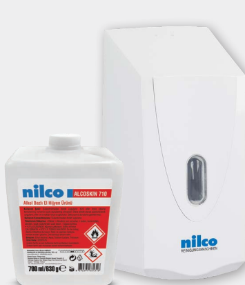
Cartridge Sensor Foam / Liquid / Sanitizer Dispenser