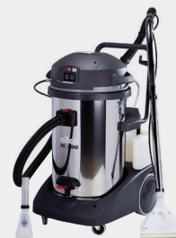
Nilco IC 390