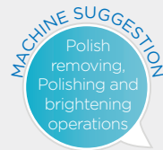
Nilco SB 1540 S