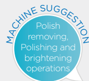
Nilco Vario Ultra 550