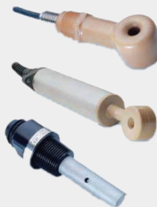
CONDUCTIVITY CONTROL TRANSMITTER AND SENSOR (AUTOMATIC DOSING ADJUSTMENT)