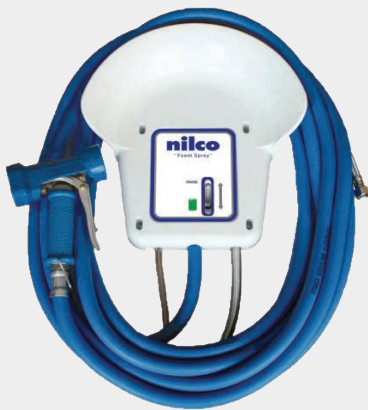
NILCO FOAM SPRAY UNIT