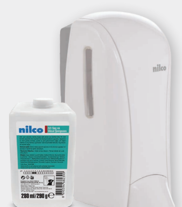
Cartridge Shampoo Dispenser 350 ml