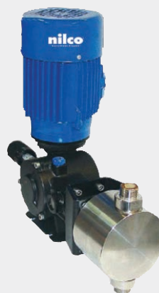
HIGH-CAPACITY WASHING MACHINES AND CIP DETERGENT DOSAGE PUMPS