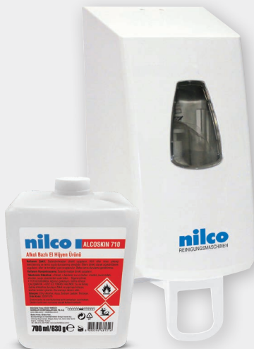
Cartridge Hand Sanitizer Dispenser 700 ml