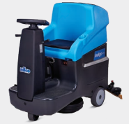
indigo BR 750